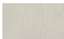
Aged Clay Nature