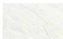
Glem White Nature

Xlight / Krion® finish Acabado Xlight / Krion®