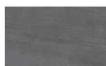
Aged Dark Nature